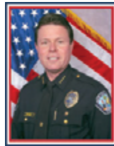
Chief William Berger

DNA EVIDENCE GIVES POLICE ADDED WEAPONS TO CLEAR OR SOLVE MORE CASES, AND CLOSE THEM FASTER. USING LODIS, LOCAL AGENCIES CHOOSE WHICH EVIDENCE THEY SUBMIT FOR ENTRY INTO THEIR OWN DNA IDENTITY REPOSITORY. OFFICERS ARE NOTIFIED AUTOMATICALLY WHEN NEW RESULTS ARE AVAILABLE.